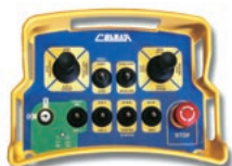
Radio remote control with automatic function