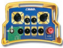
Remote control with automatic functions